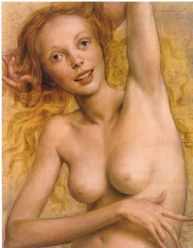
THE NEW PORTRAIT AFTER A CANCER DIAGNOSIS, IT'S INCREASINGLY POSSIBLE TO RECLAIM YOUR BODY. GOLD NUDE , 1999, BY JOHN CURRIN.